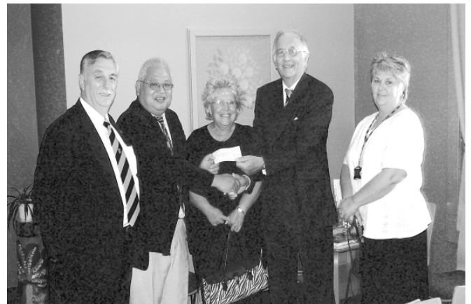
Presentation of cheque to St Margaret's Hospital, Epping From left to right