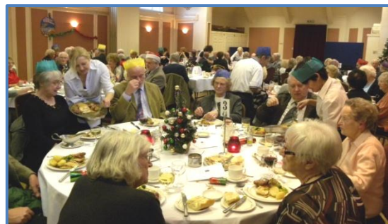
Pictured above: The Widows and their chaperons at the Annual Broken Column Christmas Luncheon 2010