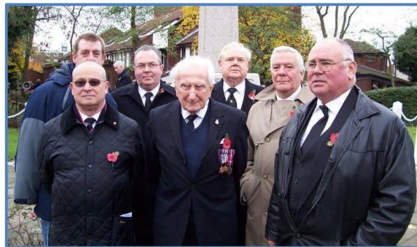
(pictured above) "Brethren of the Chingford Masonic Hall" who attended the Remembrance Sunday service held at the Chingford War Memorial on Sunday 9th November 2008.