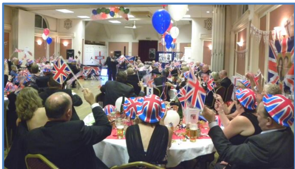
Pictured above: "A Right Royal Knees Up" – 30th April 2011