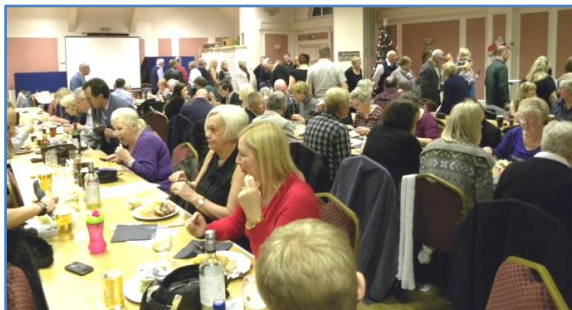
Pictured above: Everyone tucking into their "Bangers and Mash" at the Fundraiser on Saturday 19th November 2011

The annual fundraiser to raise funds for the Broken Column Luncheon was held on Saturday 19th November 2011 and was, as always, well supported by all the Lodges, Chapters and other Orders, donating and participating in the evenings fun, the result of which was an excess of £1,500 being raised. There was an excellent display of raffle prizes being donated by the members of the CAMSG.